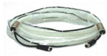
Low-Pressure Urethane Core Blast Hose

Part #: 2N0182 - 1" (2.5 cm) ID, 140 psi (8.3 bar), 20' (6.1 m) section with pneumatic trigger line