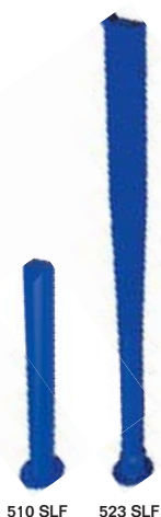
510 SLF 523 SLF

Recommended use with 1" (2.5 cm) Tube style handle. Part #: 2E0209