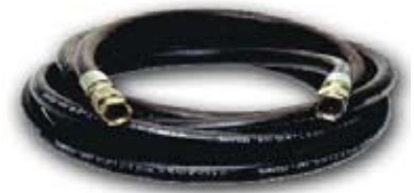
Compressed Air Hose

12-month warranty (extended warranty packages available)