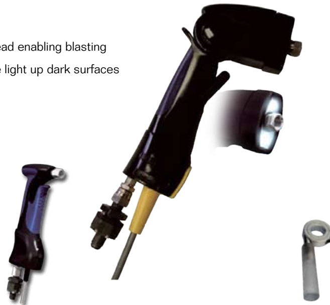
Tube Style Nozzle Handle Rotates around the nozzle for optimal comfort and control. Part #: 2E0408